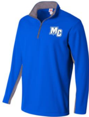
A4 1/4 Zip Color Block Fleece