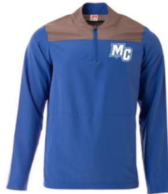
A4 Element Quarter Zip Jacket