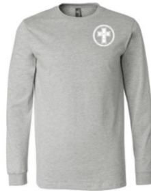
Bella + Canvas Unisex Jersey Long-Sleeve T-Shirt