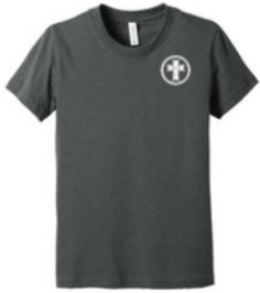
Bella + Canvas Youth Short Sleeve Tee