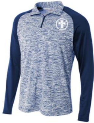
A4 Youth Quarter Zip Space Dye