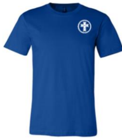
Bella + Canvas Unisex Jersey Short Sleeve Tee