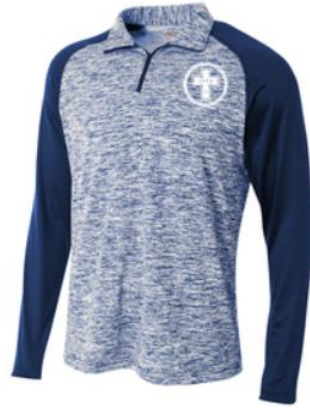
A4 1/4 Zip Space Dye With Contrast