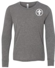
Bella + Canvas Youth Long Sleeve Jersey Tee